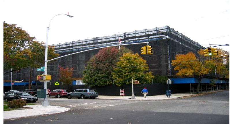
PS 133 Exterior Modernization