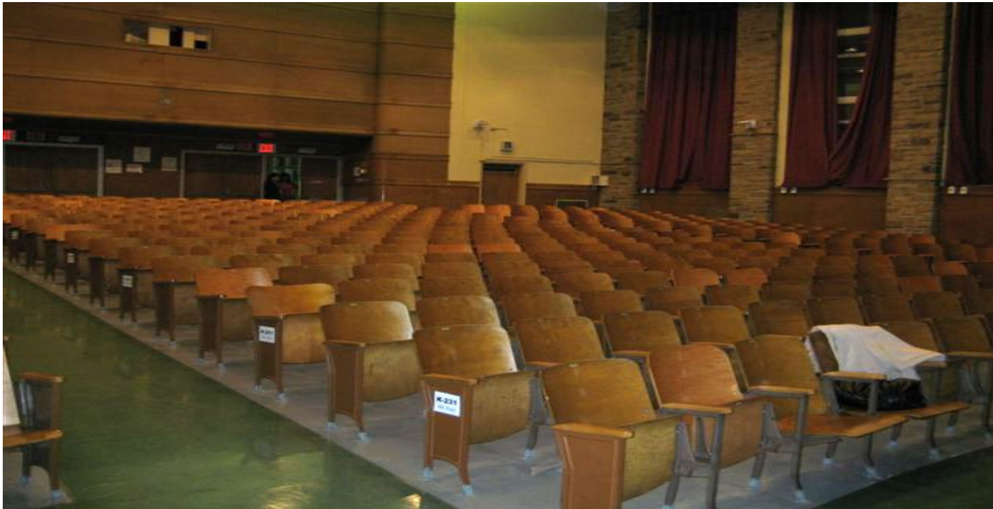
PS 205 Auditorium Upgrade

Resolution A (Reso A) projects are school-specific capital improvement or enhancement projects that are funded by individual grants from the Borough Presidents or members of the New York City Council.