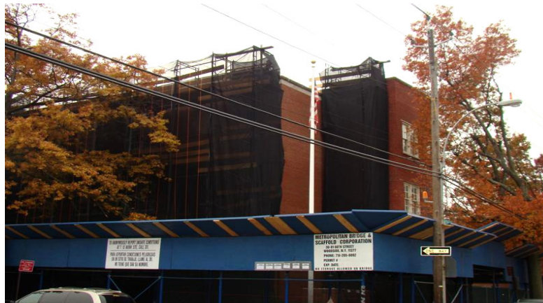
PS 188 Exterior Modernization