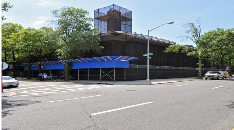
JHS 74 Exterior Modernization